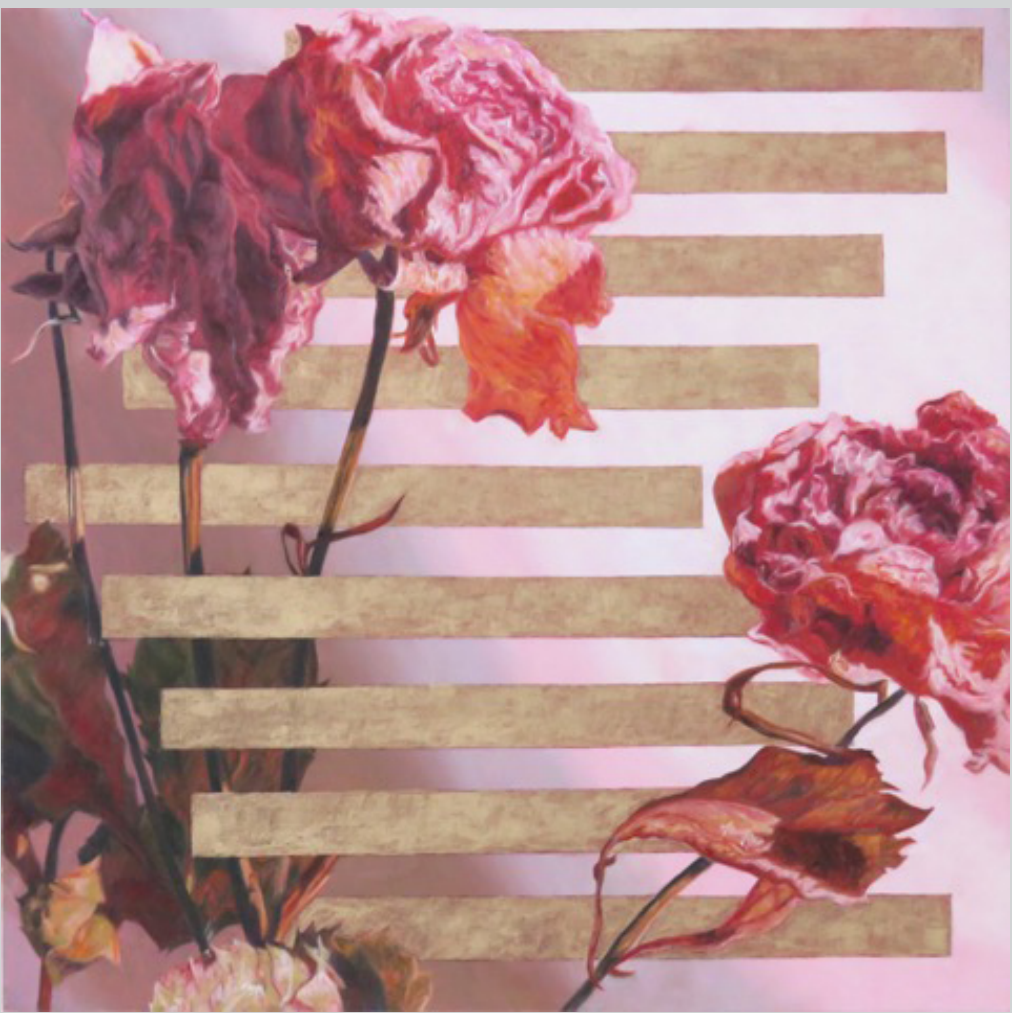
"Farewell My Lovely", oil on panel, 16" x 16", 2020

Marchand's cancellation list includes an exhibition and three workshops, one in Ireland. "All the galleries that normally represent me